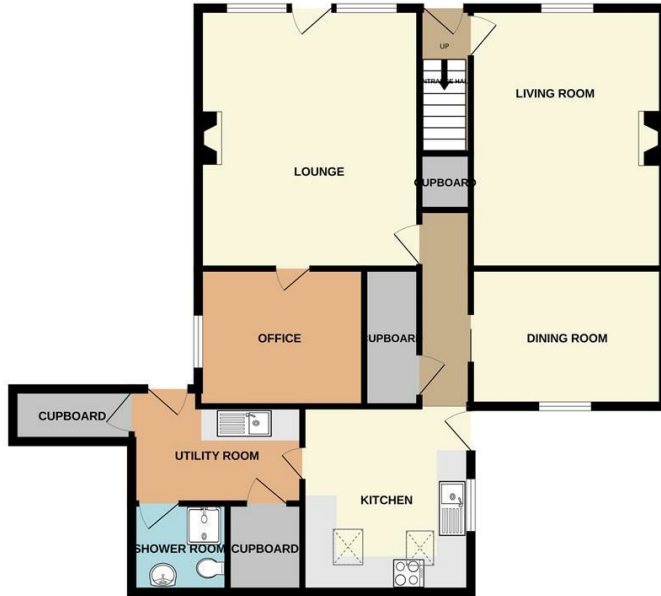
GROUND FLOOR 1018 sq.ft. (94.5 sq.m.) approx.